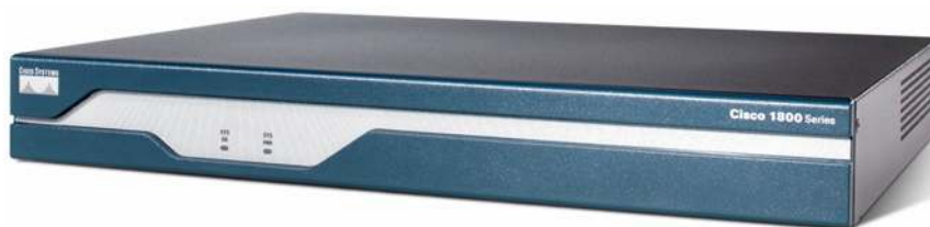
Figure 1. Cisco 1800 Series Integrated Services Routers

Support of high-density WICs (HWICs) is optional.